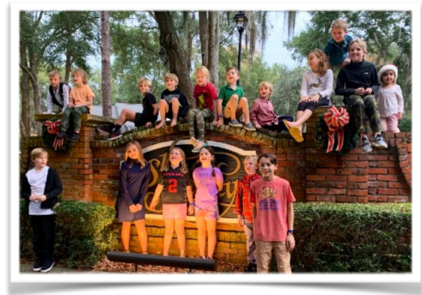
Pictured: Some of the Shaw's Bounty kids crew waiting for Santa and his fire truck last year!

So, come and wave Santa on his way with us from 7.30pm onwards!