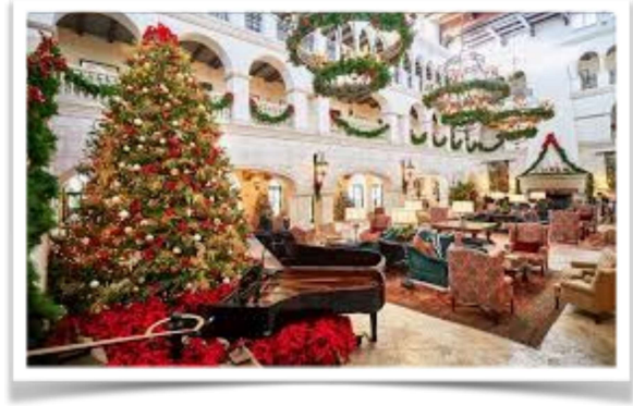
Pictured: Sea Island decked out for Christmas

Watch this space for news on our new HOA President and Secretary - coming soon!